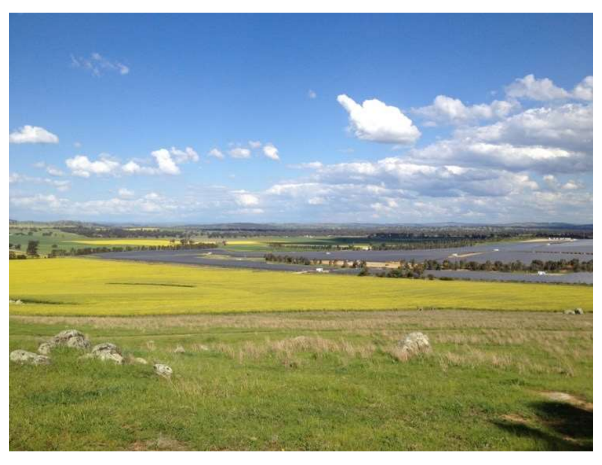
If Clouds Could Talk....The Finger of God in Righteous Anger!

A portion of the obnoxious Metka EGN/Mytilineos Solar - Bomen/Eunony Valley, Wagga Wagga.